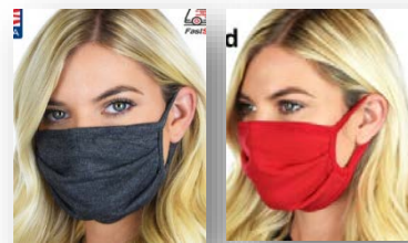
Grades 6-12 Mask

While masks for students will be optional to wear in the upcoming year (staff members will be required to wear a mask whenever physical distancing is not possible), we highly encourage their use as studies are indicating that 80% of our population wears masks, COVID-19 infections would be greatly reduced. We strongly believe that everyone can play a significant part in helping to keep others around us safe, and also help keep school in session for as long as possible if we are willing and able to simply put on a mask.