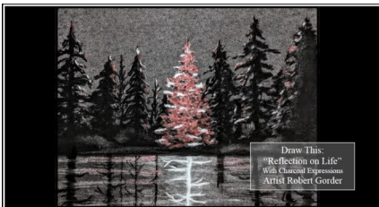
January 25 Class