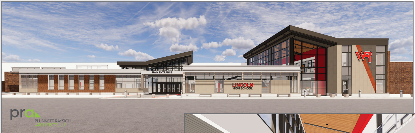
Lincoln High School Exterior and Interior Renderings