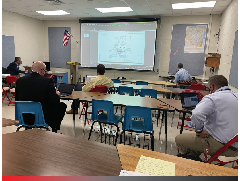
Many collaborative sessions have taken place to refine the scope of the projects.

The first focus of the referendum projects is the High School addition. With staff input driving design decisions, we are working to finalize the details and will be breaking ground on the addition this fall.